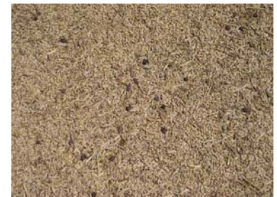
Barley contaminated with deer excreta.